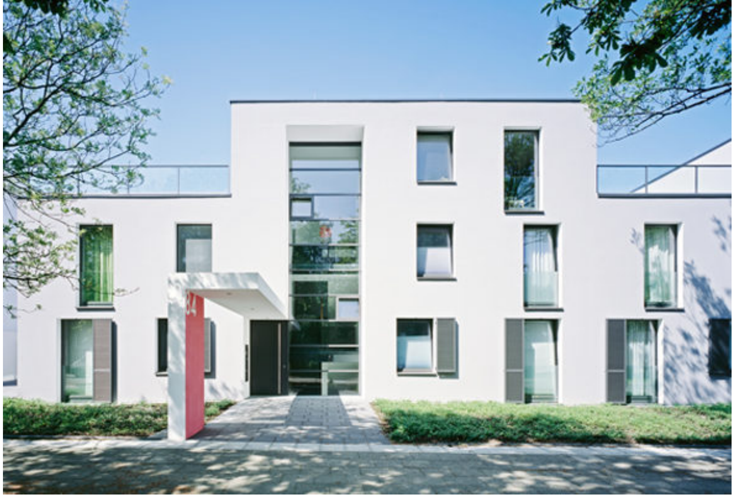
Residential Building at Dinnendahlstraße